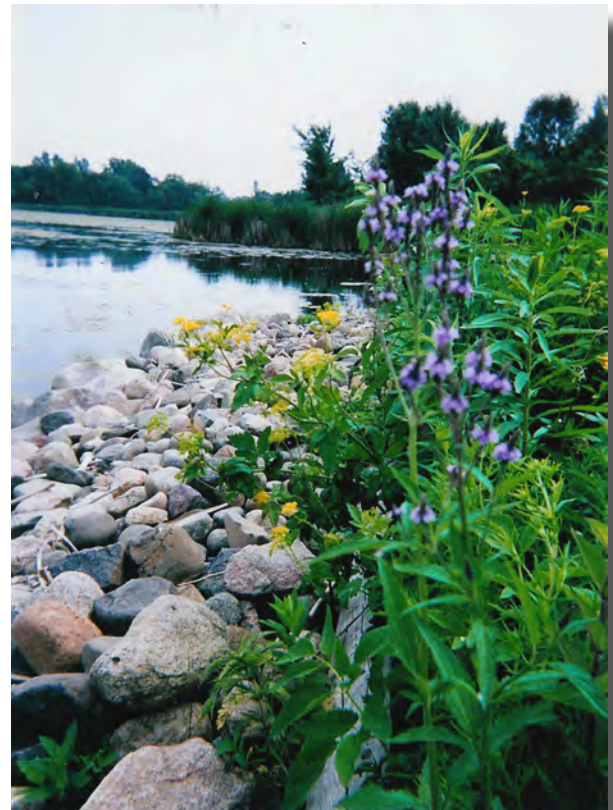
Shoreline stabilized with riprap and enhanced with a vegetative buffer.

Natural rock riprap consists of coarse stones randomly and loosely placed along the shoreline. You should consult your DNR Area Hydrologist to determine whether your shoreline needs riprap to stop erosion. If there is a demonstrated need, such as on steep slopes, you may want to consider placing riprap or a combination of riprap and vegetation. In most cases, vegetation planted in the rocks will stabilize the riprap and improve the appearance of your shoreline. Naturalizing your shoreline is the most important contribution you can make to enhance water quality, maintain fishery resources, and provide wildlife habitat.